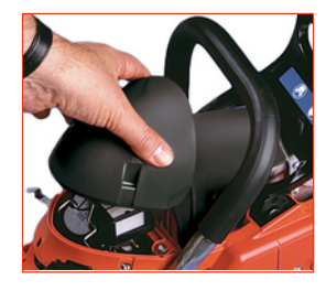
Easy filter maintenance